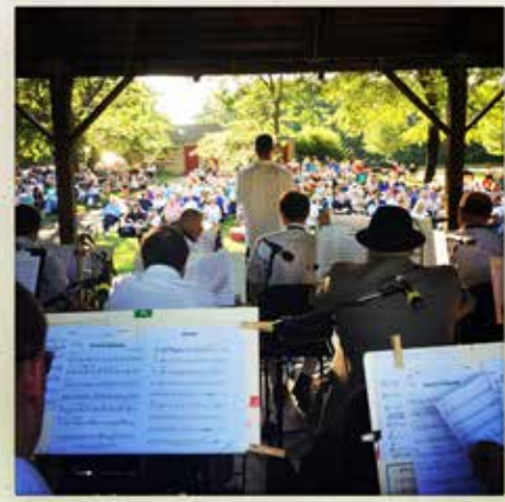
Bring your picnic to Hollow Park in Woodbury on July 15 and listen to the sounds of the Waterbury Symphony Orchestra.