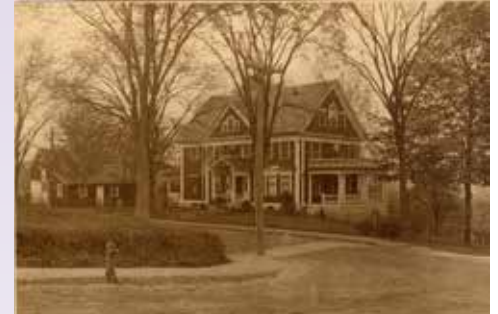
Explore some beautiful historic homes during the 2nd Annual Naugatuck Historic Home Tour on Aug. 4.